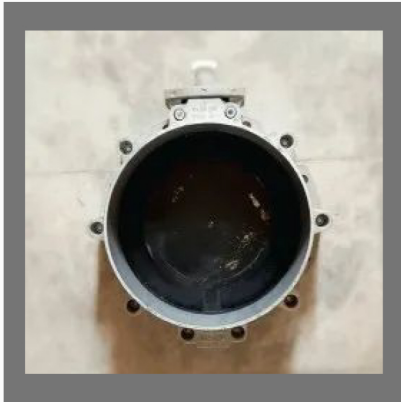
Batching Plant Butterfly Valve