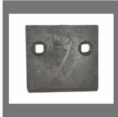
Batching Plant Stripper