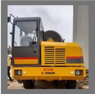
Self Loading Concrete Mixer