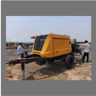
Concrete Pumps Rental Services