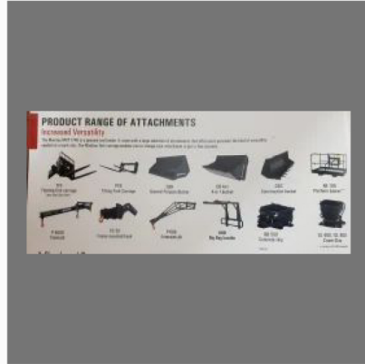
Telehandler Rental Services