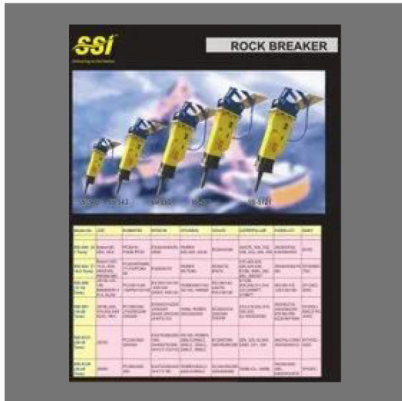
Hydraulic Rock Breaker