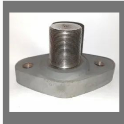
Concrete Pump Pivot