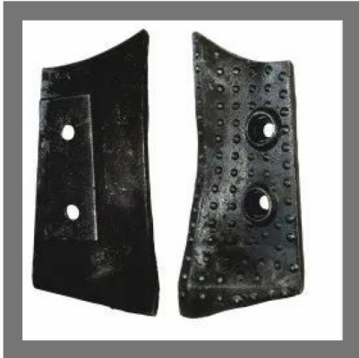
Heavy Duty Double Horns Shovel for Batching Plant