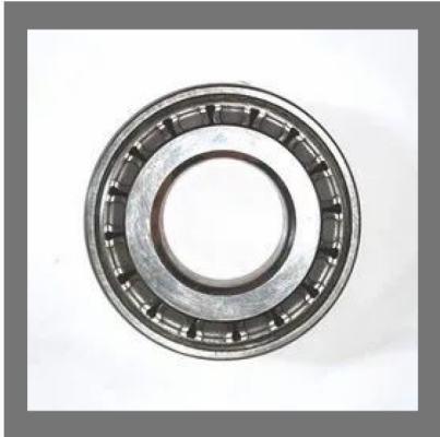
Transit Mixer Spares