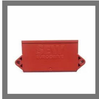
BGE1.5 Batching Plant Rectifier