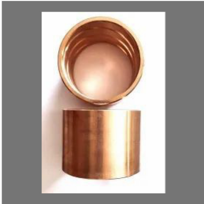
Concrete Pump Parts