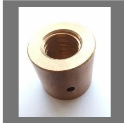
Batching Plant Bushing