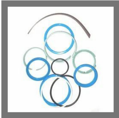
Concrete Pump Seal Kit